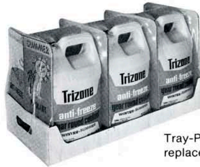
Tray-Pak for anti-freeze replaces shipping carton