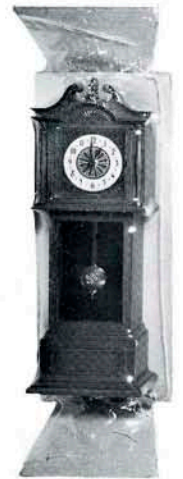
'U' Pad protects clocks and eliminates dunnage materials