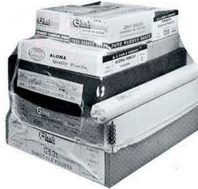
Pick 'N' Pack for stationery replaces master carton

Pictured below are just a few successful 1205 applications.